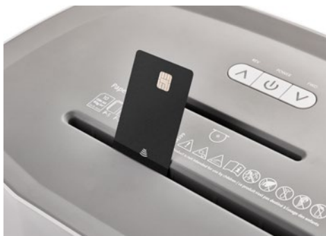
DAHLE PaperSAFE® document shredder 420